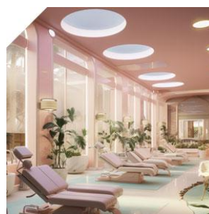
Health care Center